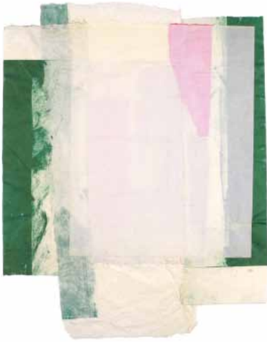
Leo Rabkin - Tennis watercolor, thread, paper 22.75 x 21.75in.