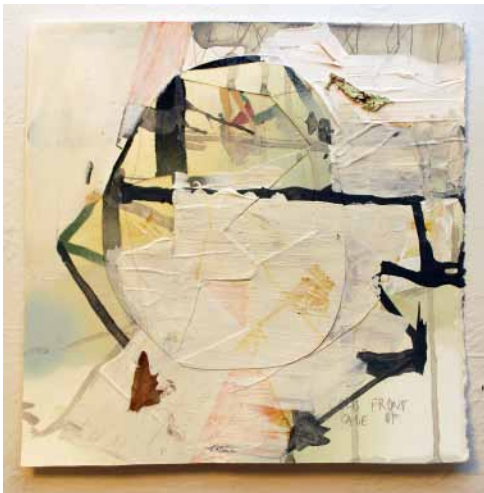
Benjamin Gardner - Untitled (cold front) Acrylic, collage, spray paint, ink, onion skin on paper 10 x 10in.