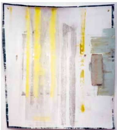
Marthe Keller - mottu propprior acrylic, PVC, linen, acetate 53 x 48in.